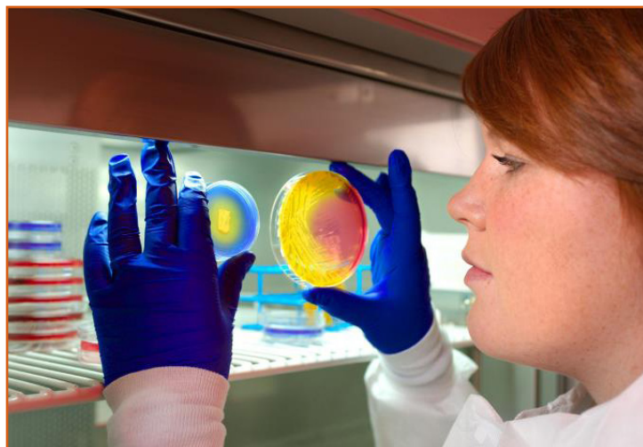
Microbiologist examining culture plates with methicillin-resistant Staphylococcus aureus bacteria.

Commonly identified antimicrobial-resistant forms of these bacteria include methicillin-resistant Staphylococcus pseudintermedius (MRSP) and methicillin-resistant Staphylococcus aureus (MRSA), which are frequently identified in dogs and people, respectively.