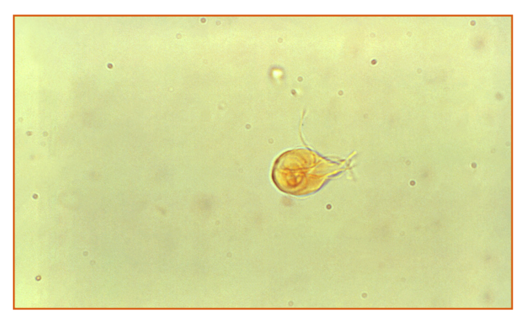
Microscopic view of Giardia , the cause of giardiasis in people and animals

Veterinarians most often diagnose giardiasis after owners notice a sudden onset of diarrhea in their young dog. Infected dogs frequently have a history of being purchased or adopted from places with dense dog populations or a history of being around other dogs or places where other dogs visit (e.g. dog parks).